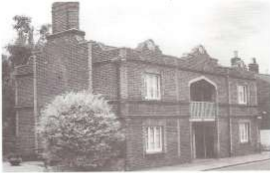
Above: Prince Albert Model Cottage built 1864

Continue straight along Cowbridge, passing the Grade II Listed Prince Albert model cottages on your left (mentioned in 'The history and heritage of the Neighbourhood Plan Area' at the beginning of the Neighbourhood Plan).